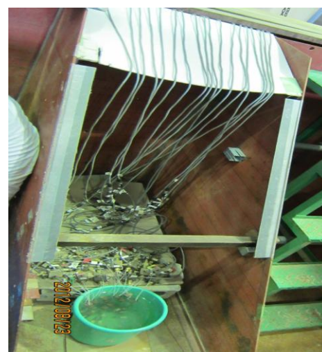
Figure 3. Pore-water pressure transducer