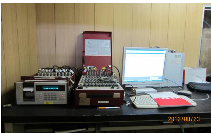
Figure 2. Auto data logging system